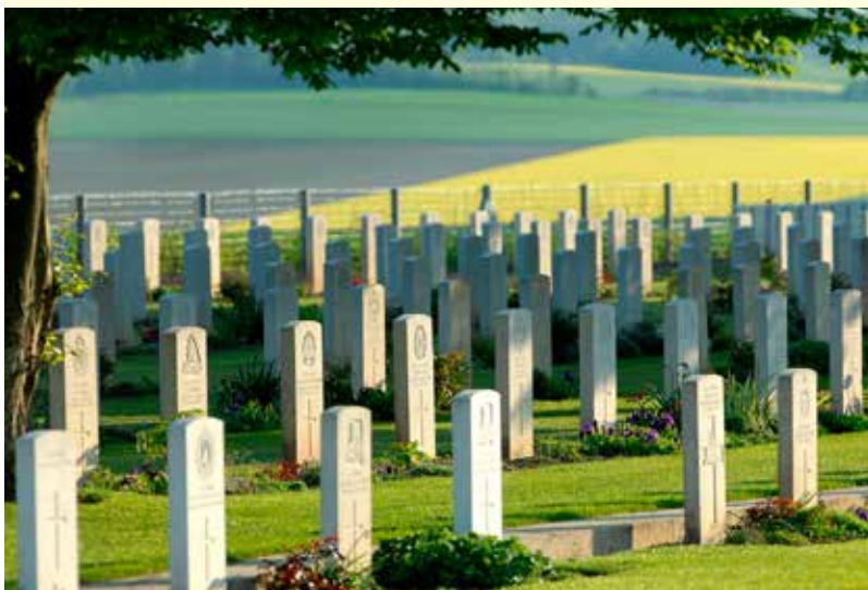
Gravestones at the Australian Military Cemetery, Villers-Bretonneux, France.

Department of Defence 20090430ran8106603_190