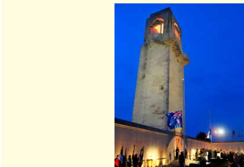
Members of the Australian and French public observe the One Minute's Silence during the 2012 Anzac Day Dawn Service at the Australian National Memorial in Villers-Bretonneux, France.

Department of Defence 20090430ran8106603_190