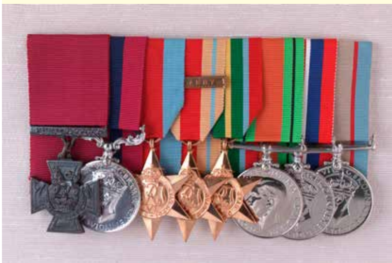
Medals of Lieutenant Thomas Currie Derrick, VC, DCM (1914–1945).