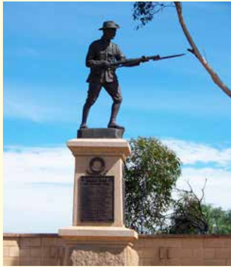
Mannum War Memorial, South Australia.