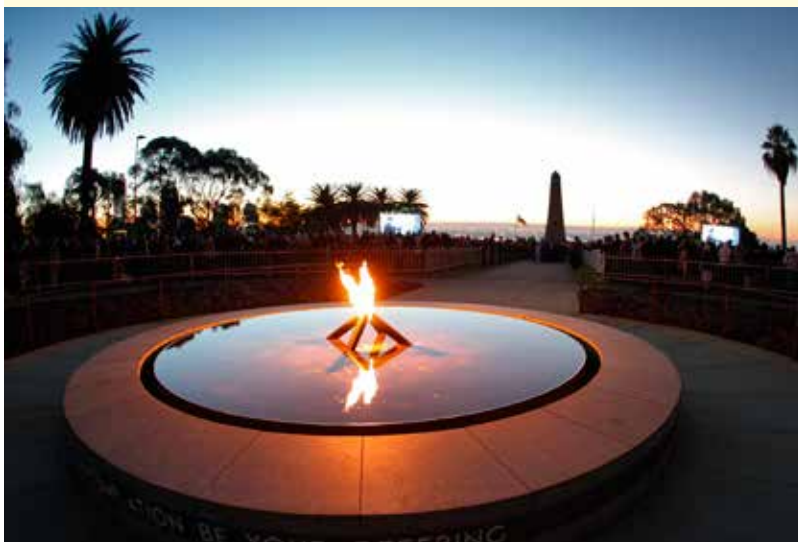
An eternal flame lights the dawn service at the State War Memorial, Kings Park, Perth.

Department of Defence 20100717adf8243116_464