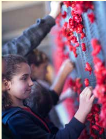
School students place poppies on the Roll of Honour at the Australian War Memorial.