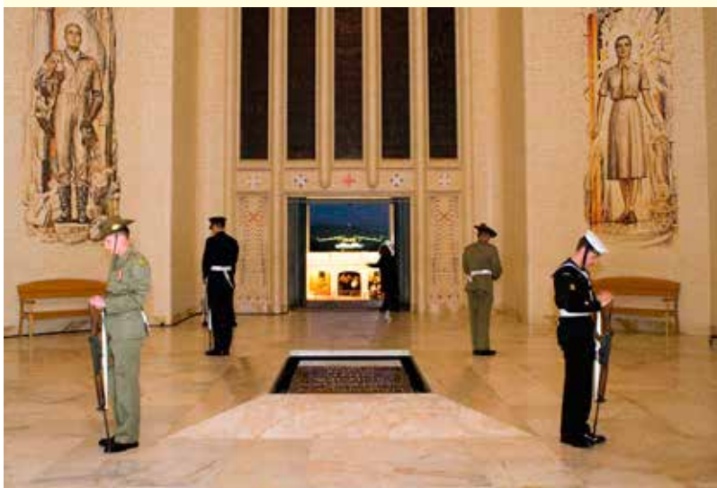
The catafalque party in position around the Tomb of the Unknown Soldier at the Australian War Memorial. Through the entrance to the Hall of Memory, Parliament House can be seen.

Department of Defence 20070425afg8100279_008